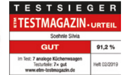
Silvia kitchen scale