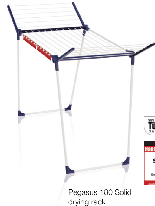
Pegasus 180 Solid drying rack