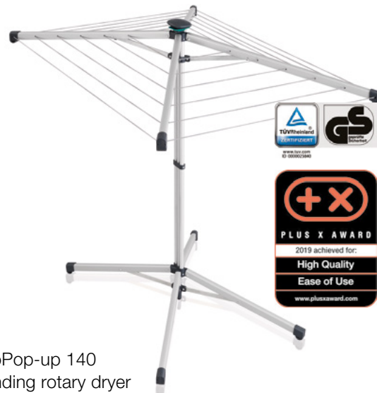
LinoPop-up 140 standing rotary dryer