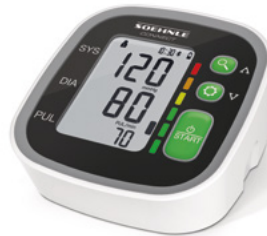
Systo Monitor Connect 300 blood pressure monitor