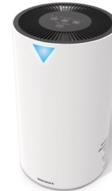
AirFresh Clean 300 air purifier