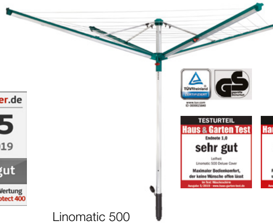
Linomatic 500 Deluxe Cover and 400 easy rotary dryers