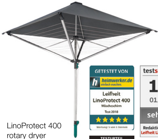
LinoProtect 400 rotary dryer