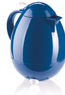
Columbus insulating jug