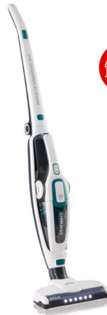
Regulus PowerVac 2 in 1 cordless vacuum cleaner