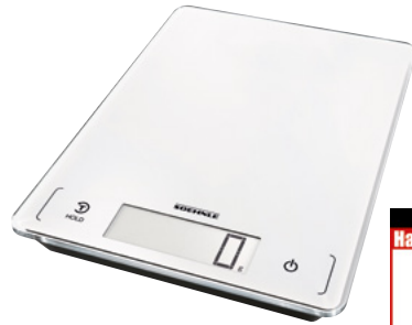
Page Profi 300 kitchen scale