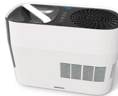
AirFresh Hygro 500 air humidifier