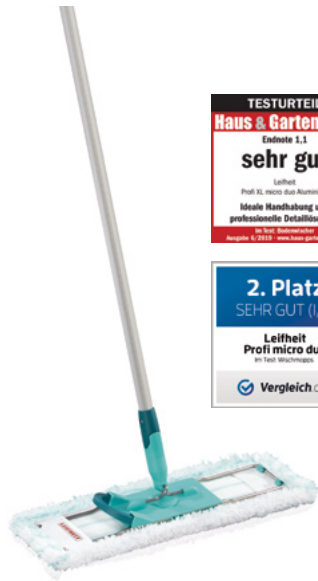
Profi Micro Duo Aluminium floor wiper