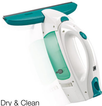
Dry & Clean window vacuum cleaner