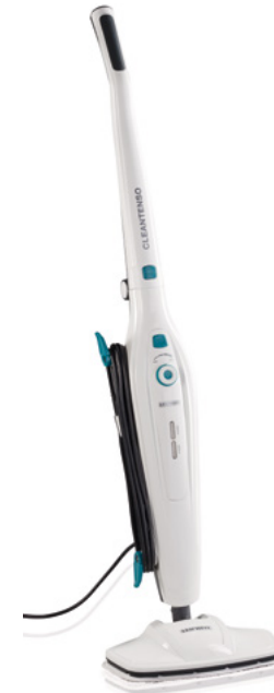
CleanTenso steam cleaner