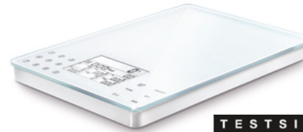
Food Control Easy kitchen scale