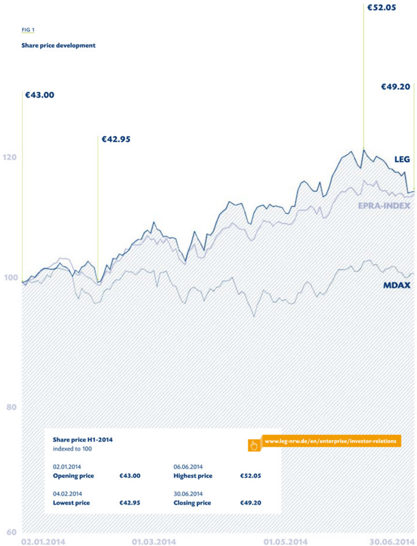
Share price development